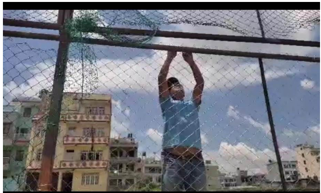
Maintenance of fence in Reale Ground