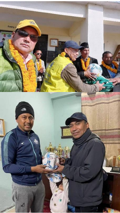
Distribution of soccer balls to Lions Club

Reale World will work with the Kathmandu Lions Club to donate football goods to village schools in Nepal. This time, Reale World delivered uniforms and balls along with teaching materials and bags to a school in a village in Sindhupalchok District, which is a two-hour drive from Kathmandu. In Nepal, where there is a large gap between urban areas and villages, I would like to provide opportunities for young people in villages to have various experiences. We would like to continue to work with Lions Clubs, which are active in local communities in Nepal, to deliver goods donated by everyone in Japan to villages where it is difficult to obtain equipment even if they want to play soccer. .