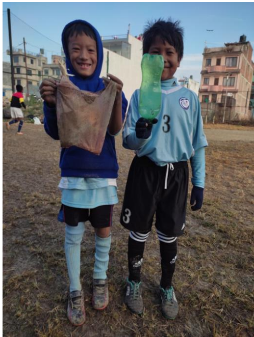
Reale Kids cleaning the ground