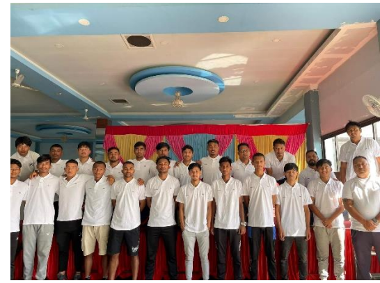
FC REALE SENIOR TEAM

All of them will show the results of their practice so far and hope to play with all their power. Thank you for your continued support for "Hero Project ZERO".