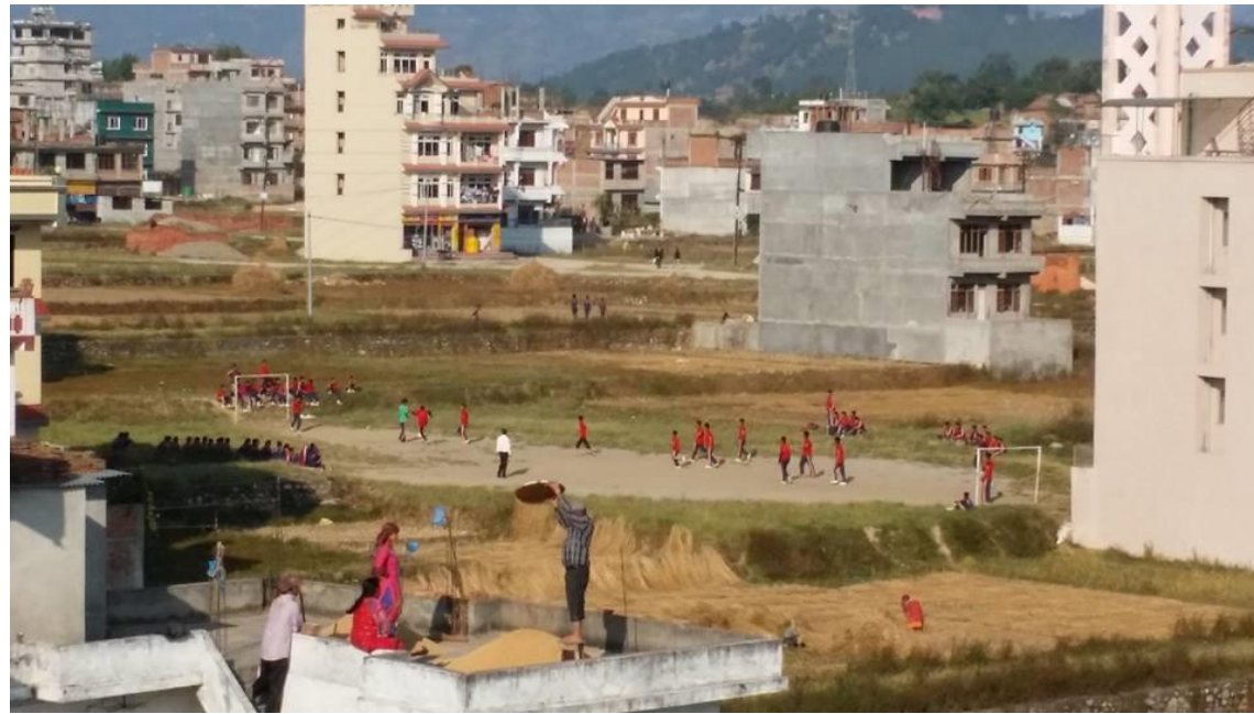
FC REALE GROUND before fencing