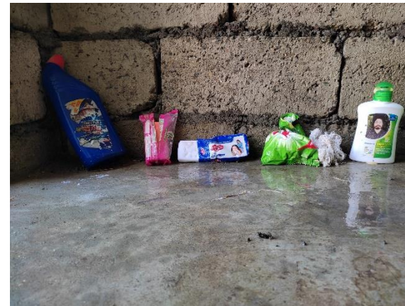
Sanitary soaps and toilet cleaners!