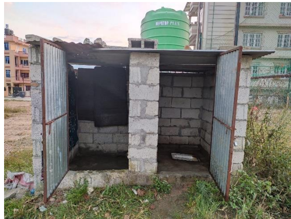
A storeroom and toilet