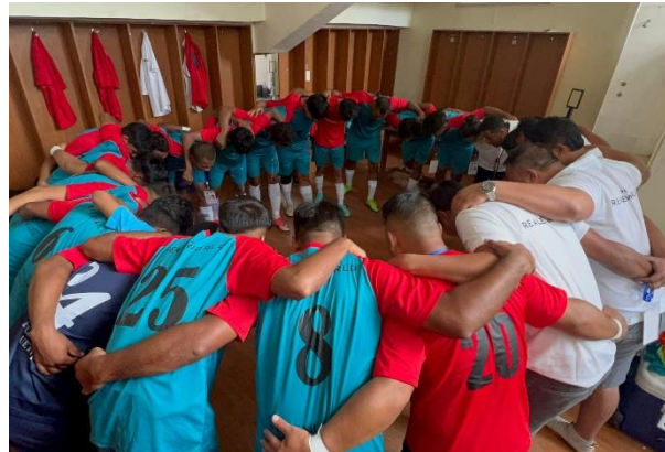
TARGET – Professional League