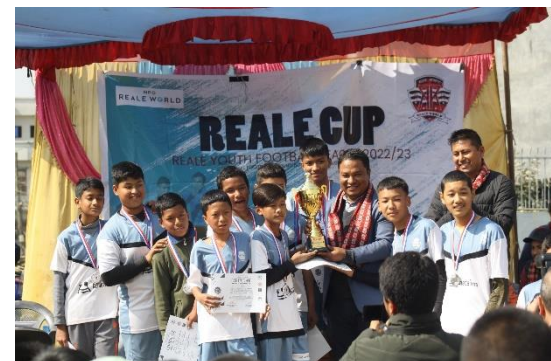
U15 BHARAV – 3 RD POSITION