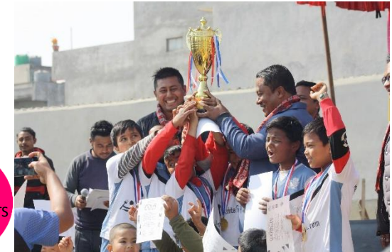
U10 GARUD – 1 ST POSITION

The tournament was categorized to U10, U13 and U15 while the match being played every Saturdays. In this tournament, players had to register themselves individually, no team registration! Two invited academies namely Khwopa Kings and SWSC FA also participated in Reale Cup. The total number of participating players in Reale Cup 2022-23 is 225!!!