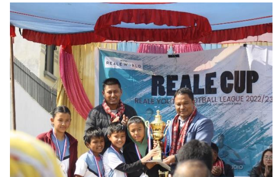
U13 GARUD – 2 ND POSITION