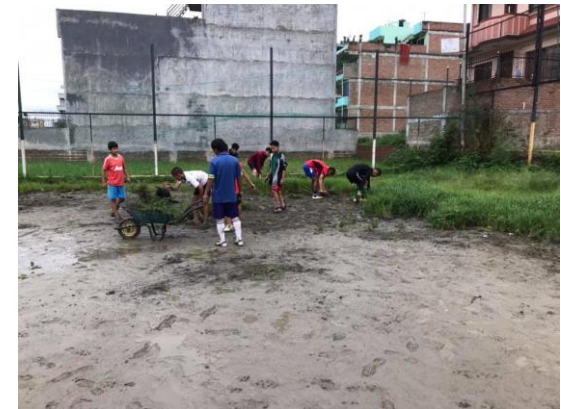
Cleaning weeds during Rainy Season