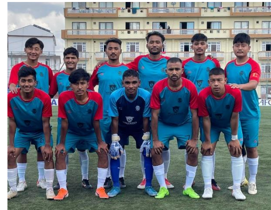
FC REALE IN C QUALIFIERS 2022