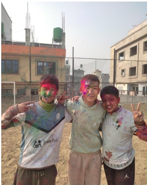
Celebrating traditional spring festival "Holi" with colours!

Since there are many families who find it difficult to purchase soccer equipment, shoes, jerseys, etc., we provide necessary supplies from Japan. Our goal is to create a place where children can experience, through soccer, that anyone can do anything regardless of their circumstances, regardless of nationality or race.