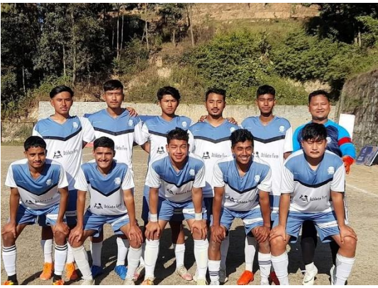
FC REALE SENIOR TEAM