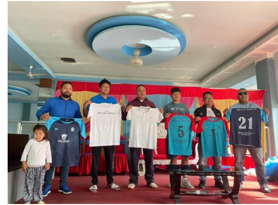
FC REALE SUPPORTERS