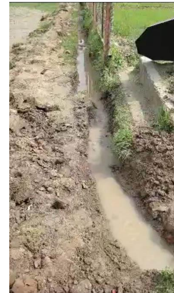
Drainage in Rainy Season